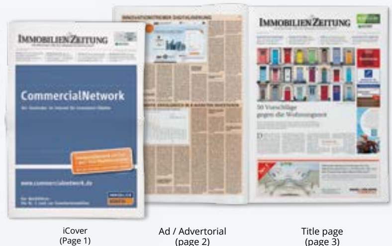
iCover (Page 1)

The iCover can be used as advertising space or as an advertorial. The real page 1 is preceded by a "fake page 1" with a whole page of advertising space on its rear side, offering a particularly prominent placement compared to the real page 1. Price: € 58,230